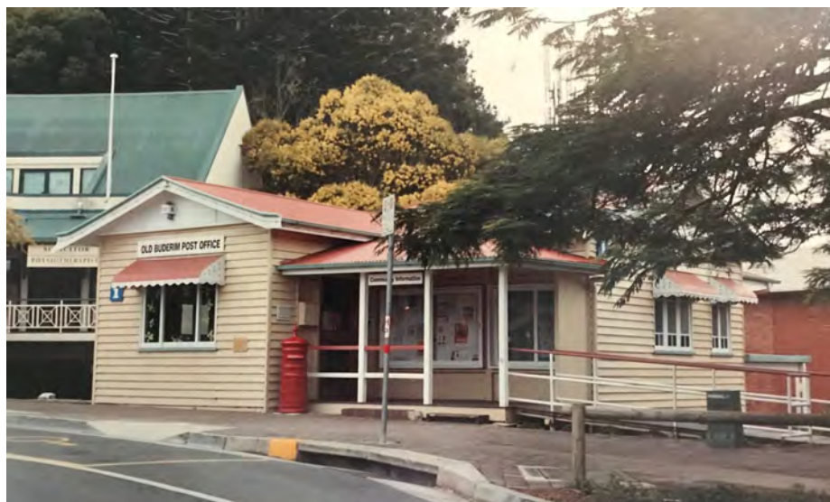
A photo of the Old Post Office circa 2002 with the old Post Box in place before it was removed overnight. We never did find it, wonder where it is now.

To all our Affiliated Community Groups remember the OPO front window is available to you to advertise your events. Brochures to support your activities can be left at the centre too.