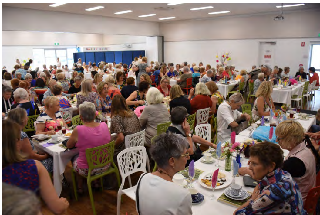
Over 200 people attended the Colours of Buderim Fashion Parade

Friends chatted, enjoyed the superb afternoon tea provided by Foundation supporters, and everybody appreciated the professionalism of the excellent parade which incorporated a great range of beautiful clothing ideas all displayed by five excellent models.