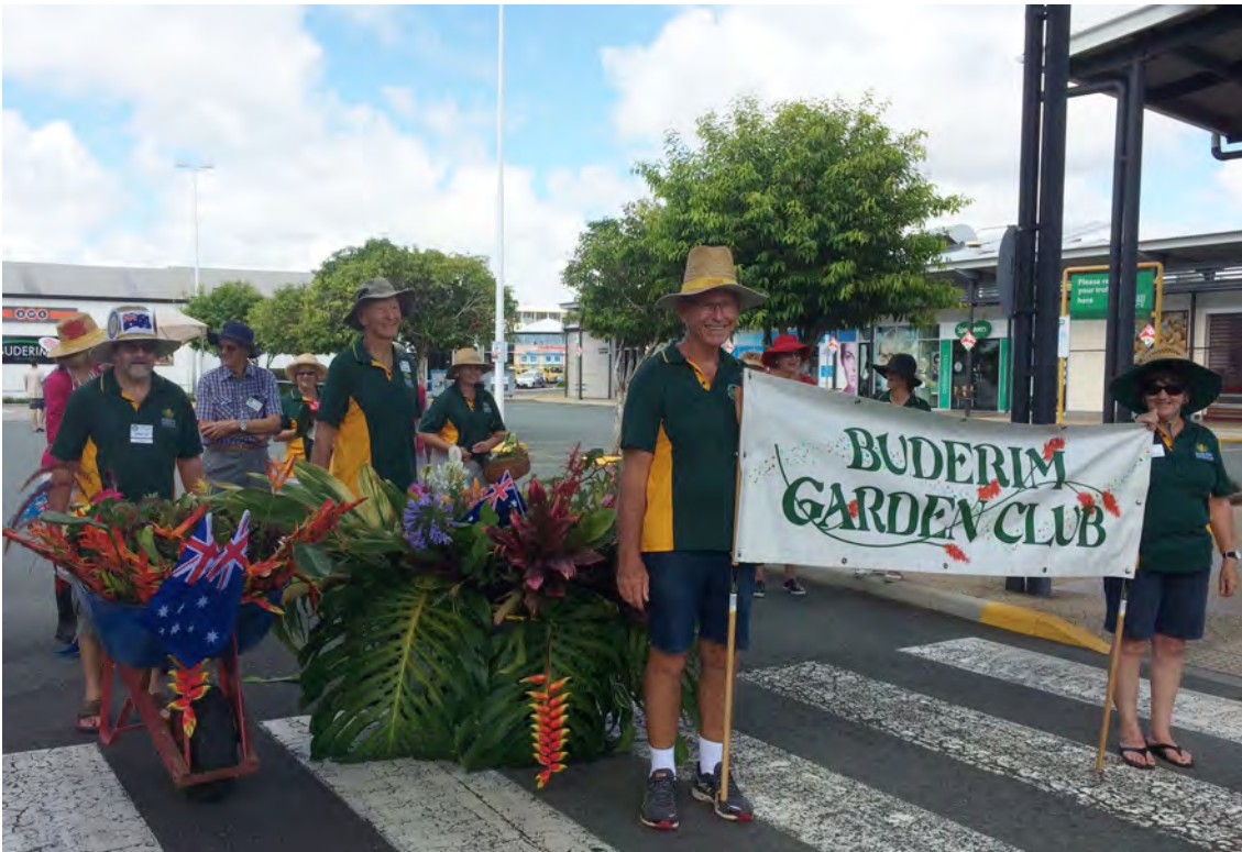
Buderim Garden Club came 3rd in the Australia Day parade