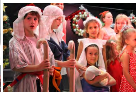
BYEs Theatre Company

It was estimated that up to 3000 attended the 2017 Carols on Buderim which made the evening a great success. We were so grateful that the weather was also in our favour.