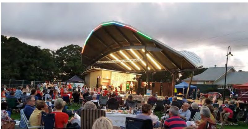
The new stage completed just in time for Buderim Community Carols