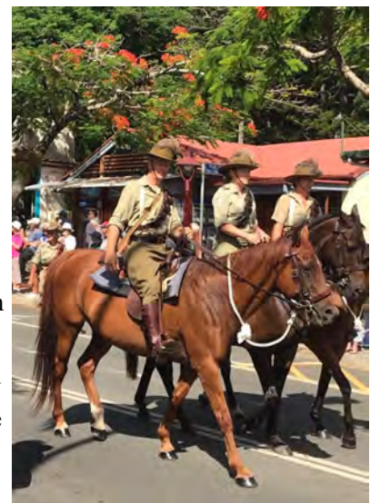
The Light Horse