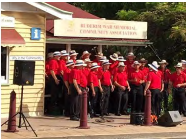
Sunshine Statesmen Barbershop Chorus performing on Australia Day last month.