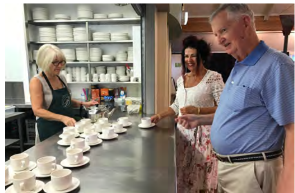
Friends of Buderim served their usual scrumptious afternoon tea