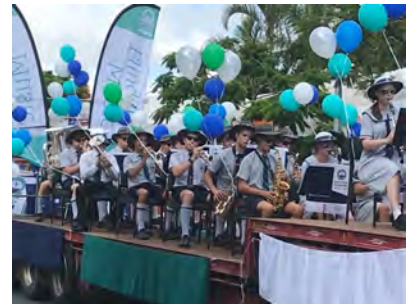
Matthew Flinders Anglican College came 2nd in the parade

As ever our thanks to the Queensland Police Service, the State Emergency Services and the Sunshine Coast First Aid Volunteers for ensuring that the day was peaceful, incident free and enjoyed by everyone.