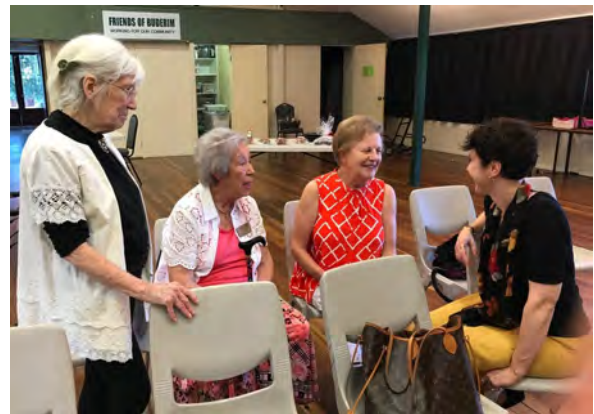
Old friends catch up