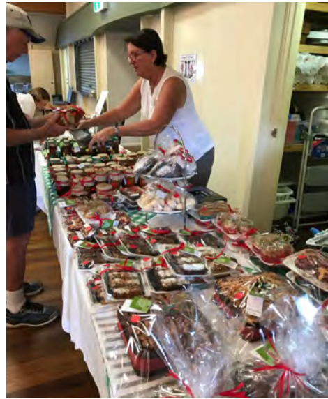
Friends' famous Christmas stall

ANZAC Day Friends of Buderim provide morning tea for up to 400 people every year after the ANZAC Service. If anyone can help with biscuits or slices please drop them off at the school tuckshop from 8.00am on the day, or leave them at the OPO the day before.