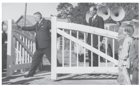
Opening of the new gates, 1953.