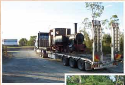
Leaving Murrumba Downs

A donation of any size can make a real difference.