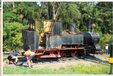
Loco placed on tracks Wises Farm